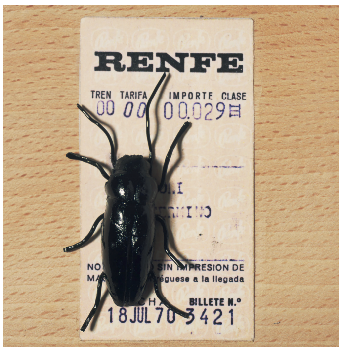
Joan Brossa, 18 de juliol , 1970. MACBA Collection. MACBA Consortium. Joan Brossa Fonds. Long-term loan of Fundació Joan Brossa

Exhibition from 21 September 2017 to 25 February 2018